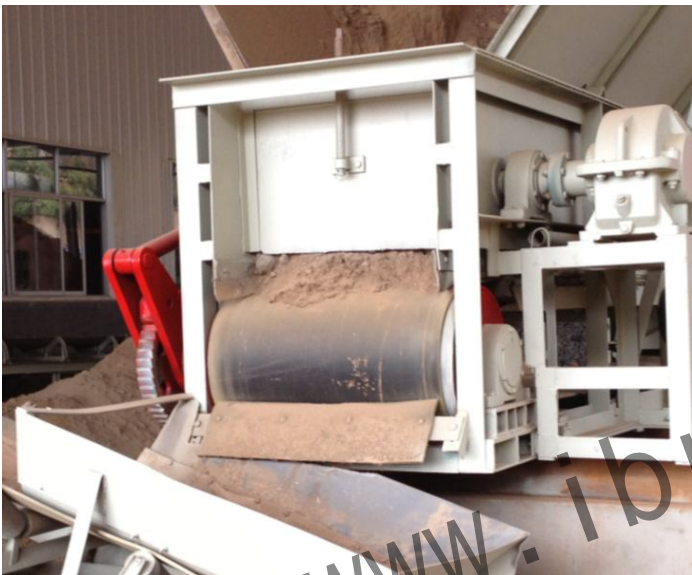
The driving roller drives the belt to feeding materials continuously.

Primary structure of equipment: electromotor, reduction box, driving roller, driven roller, conveyor belt.