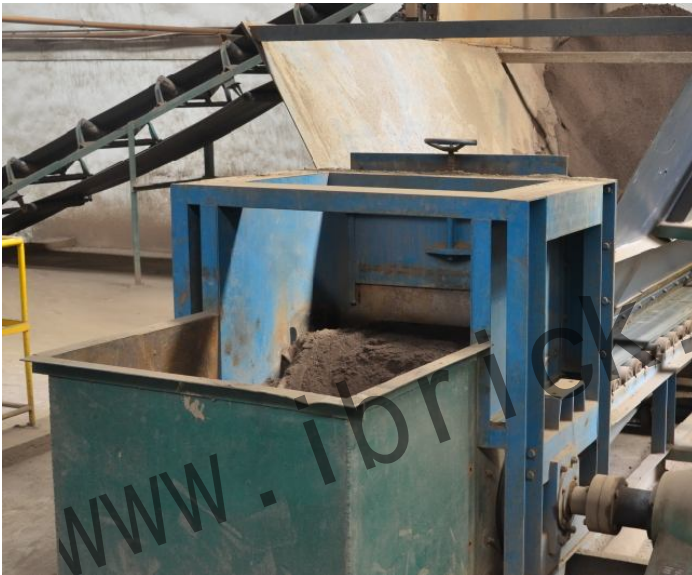
The dam-board at the mouth of feeder can ensure the feeding capacity in unit time.